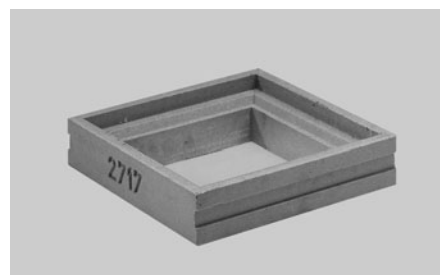
Levelling element for the adjustment of the building height of the sump unit to the surface plane