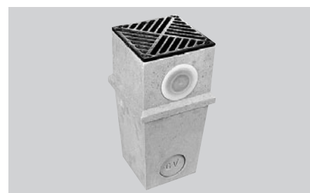
Garden gully made of polymer concrete for connecting the roof down-comer, the grating made of cast-iron, plastic basket (PP), pre-forming for outlet DN 100, removable FAT, pre-forming DN 100 for connecting the rain down pipe