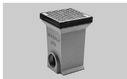
Garden gully made of polymer concrete, cast-iron frame and grating made of galvanised steel – mesh, a basket (PP), pre-forming with the NBR-O-ring for the outlet DN 100, and removable FAT