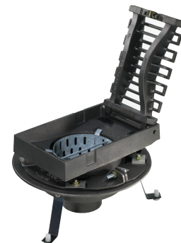
Bridge discharge for reinforced concrete bridges, HSD-5.