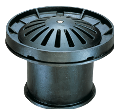
Bridge discharge for gravel bridges.