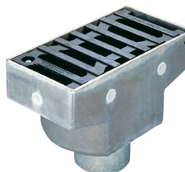
Bridge discharge for steel bridges.