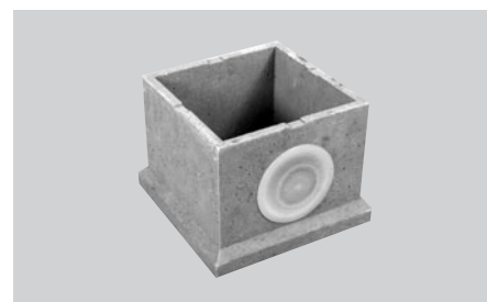
Extension made of polymer concrete for the garden gully for the extension of the building height, pre-forming DN 100 for connecting the rain down pipe