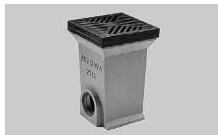
Garden gully made of polymer concrete, cast-iron frame and grating made of cast-iron, a basket (PP), pre-forming with the NBR-O-ring for the outlet DN 100, and removable FAT