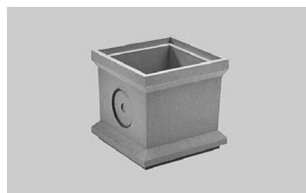
Superstructure made of polymer concrete for the garden gully for the extension of building height, pre-forming DN 100 for connecting the rain down pipe – side inflow